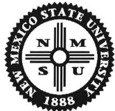
Official Seal of New Mexico State University

The established and official symbol or stamp which authenticates official action taken, award bestowed, and/or signatures of the members of the NMSU Board of Regents. Adopted in December 1962 by the New Mexico State University Board of Regents, the circular design of the NMSU Seal has the words New Mexico State University and the date, 1888, around the edge of the circle and a Zia, with the letters N, M, S, U, in the four corners of the Zia symbol within the circle as shown here: