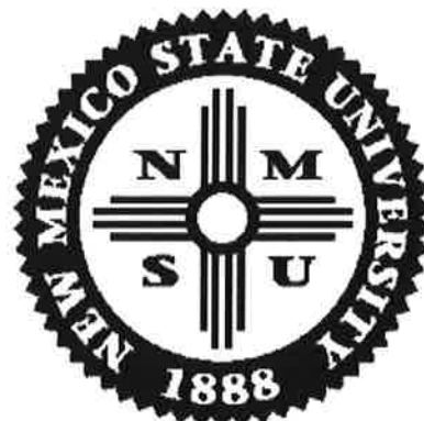
Official Seal of New Mexico State University

The established and official symbol or stamp which authenticates official action taken, award bestowed, and/or signatures of the members of the NMSU Board of Regents. Adopted in December 1962 by the New Mexico State University Board of Regents, the circular design of the NMSU Seal has the words New Mexico State University and the date, 1888, around the edge of the circle and a Zia, with the letters N, M, S, U, in the four corners of the Zia symbol within the circle as shown here: